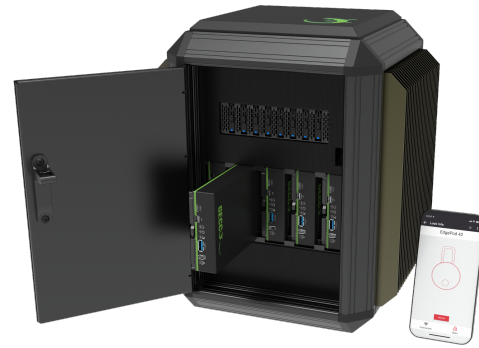
Fig. 2. Compact edge computing appliance reference design in a 30cm cube chassis