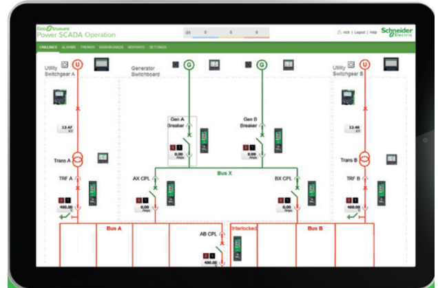
Fig. 5. Substation one-line status diagram provided in real time by monitoring and control software

To meet this demand, computing capacity at the substation level is necessary. This can be facilitated by the Edge Cloud Appliance, which hosts virtual machines (VMs) that contain the operating environments for each native software application designed for the substation equipment. These devices allow for future scalability of the system, accommodating the growing volume of data that must be managed.