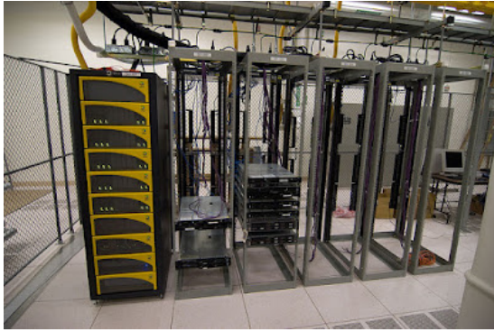
Fig. 1. Common in data centers, 19-inch racks and cabinets require dedicated space and are not ideal for substation use 1