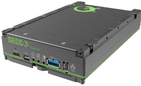
Fig. 3. Miniaturized server-class computing module measures 100mm x 160mm

Virtualization allows software provided by a number of independent vendors to share the computing resources of a group of servers. Virtualizing these systems on a shared Edge Cloud Appliance can greatly simplify maintenance and repairs, and make it easier to manage spare parts and upgrades.